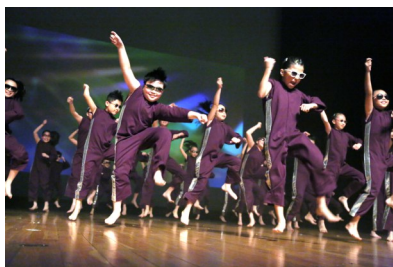
Gangnam Style at the Gala