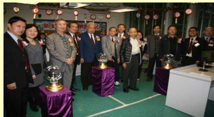
The S.T.F.A. Board Member Sponsors

teractive elements. I wish there were more computer rooms in all schools. In the old days, learning without multimedia equipment was much different. I would like to thank all the people that made the computer room possible.