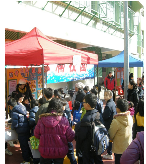
Fun at the Fun Fair!